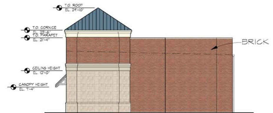
4 WEST ELEVATION SCALE: 1/16" = 1'-0"