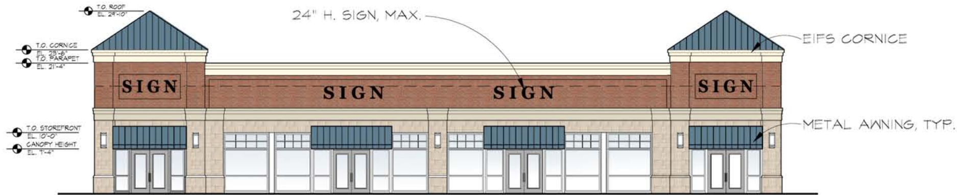
1 NORTH ELEVATION SCALE: 1/16" = 1'-0"